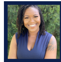
Tiffany Ford Through March 2025