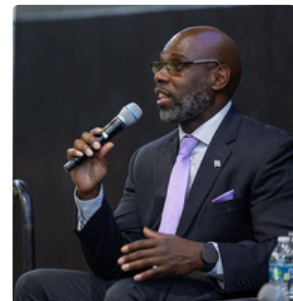
Returning Resident Services